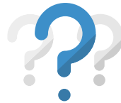
Decrease Fraud and Fake Accounts