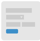
Reduce Onboarding Friction

Whitepages Pro provides risk solutions to help build trust and safety in marketplace platforms with real-time, global data to accelerate the onboarding experience. Our low-latency, high-scalability APIs reduce friction and account risk including: promotion abuse, fake account creation, transaction risk, and offline risk. We apply pattern recognition, predictive analytics, and machine learning to the five core consumer attributes of email, phone, person, physical address, and IP to deliver unparalleled coverage and accuracy.