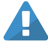
Eliminate Promotion Abuse